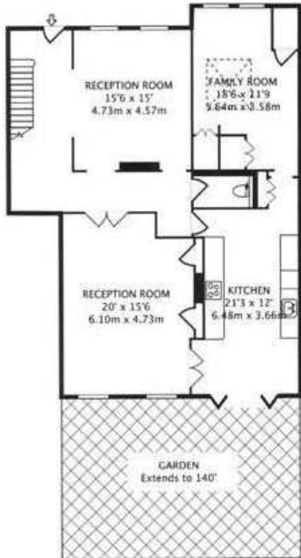
GROUND FLOOR GROSS INTERNAL FLOOR AREA 1,170 SQ FT/108.79 SQ M