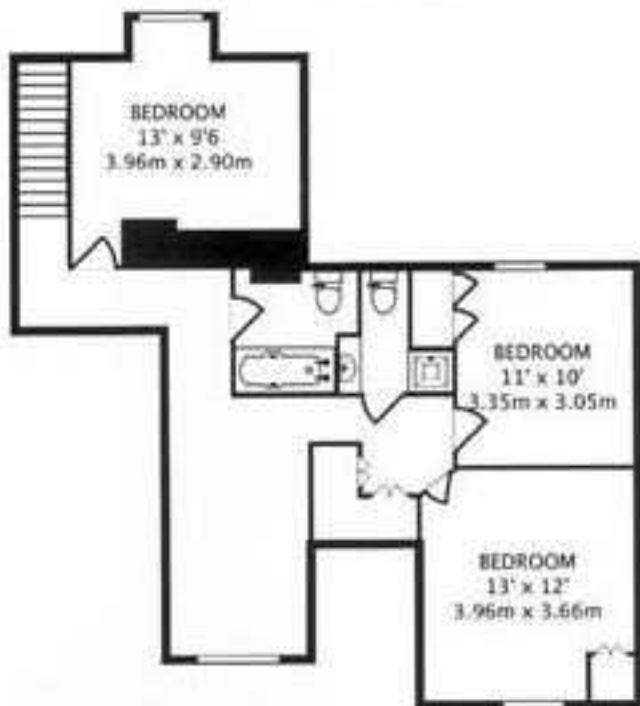
SECOND FLOOR GROSS INTERNAL FLOOR AREA 751 SQ FT/69.83 SQ M