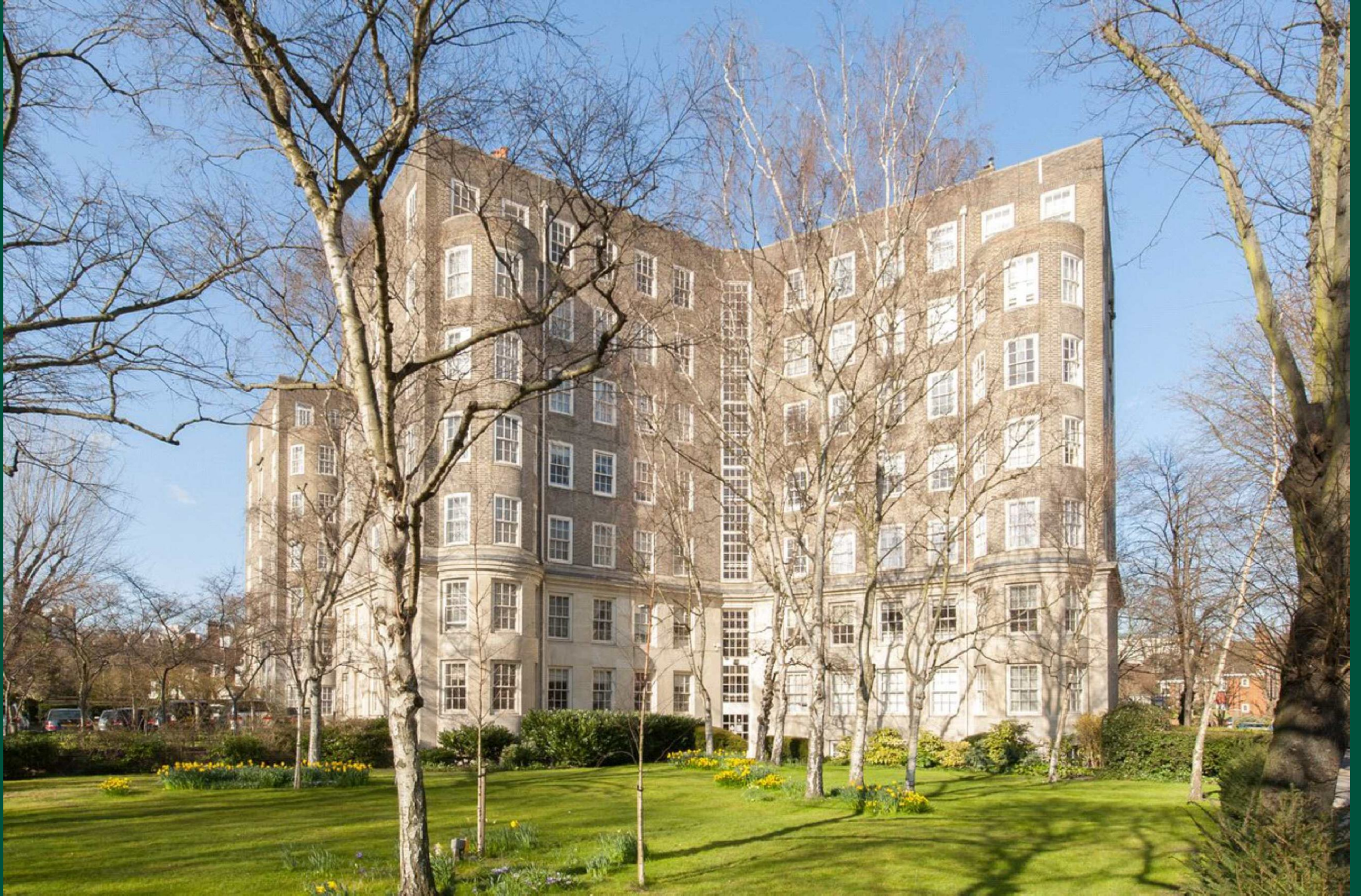
South Lodge, St Johns Wood, NW8