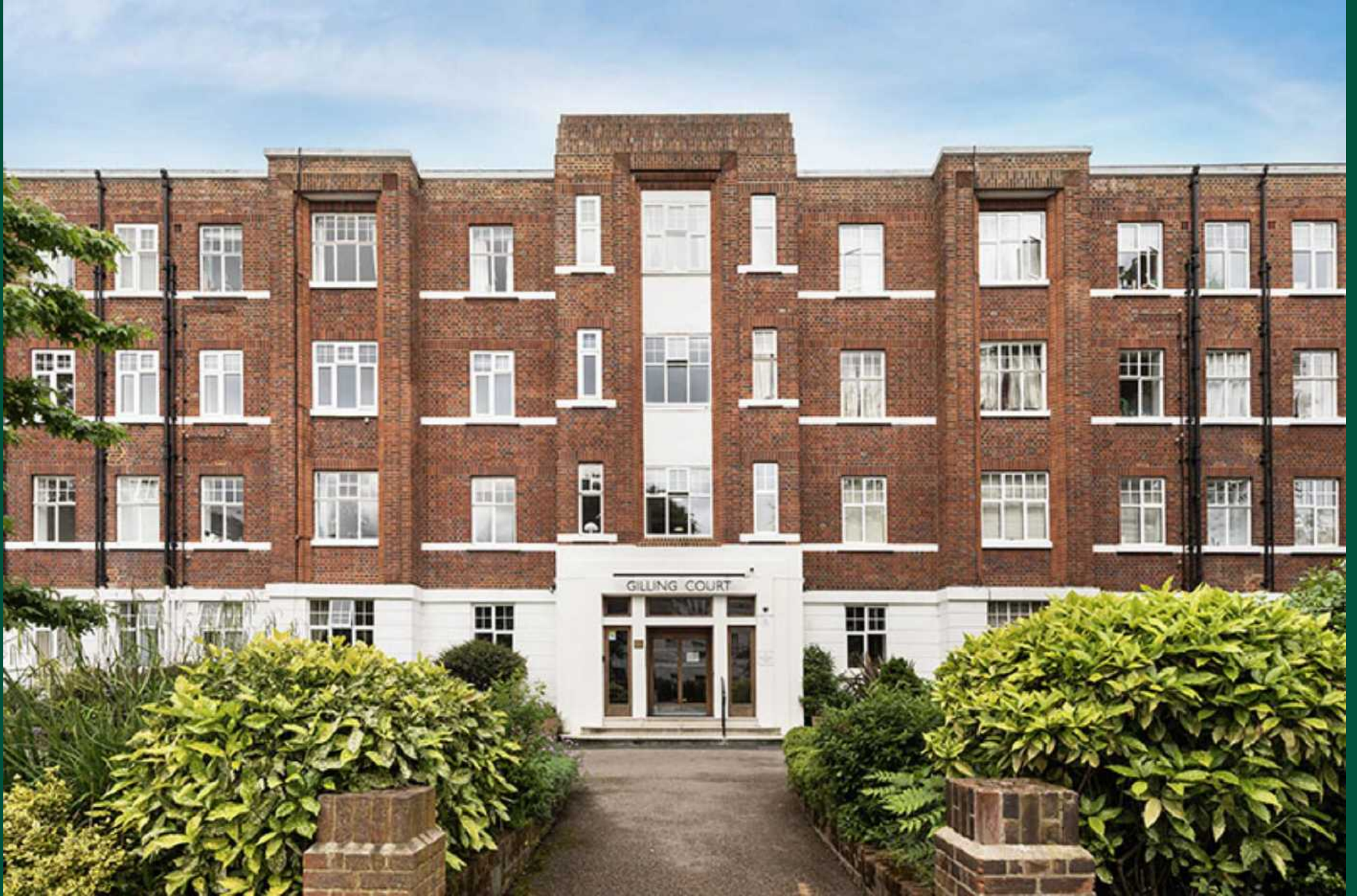
Gilling Court, Belsize Grove, London, NW3