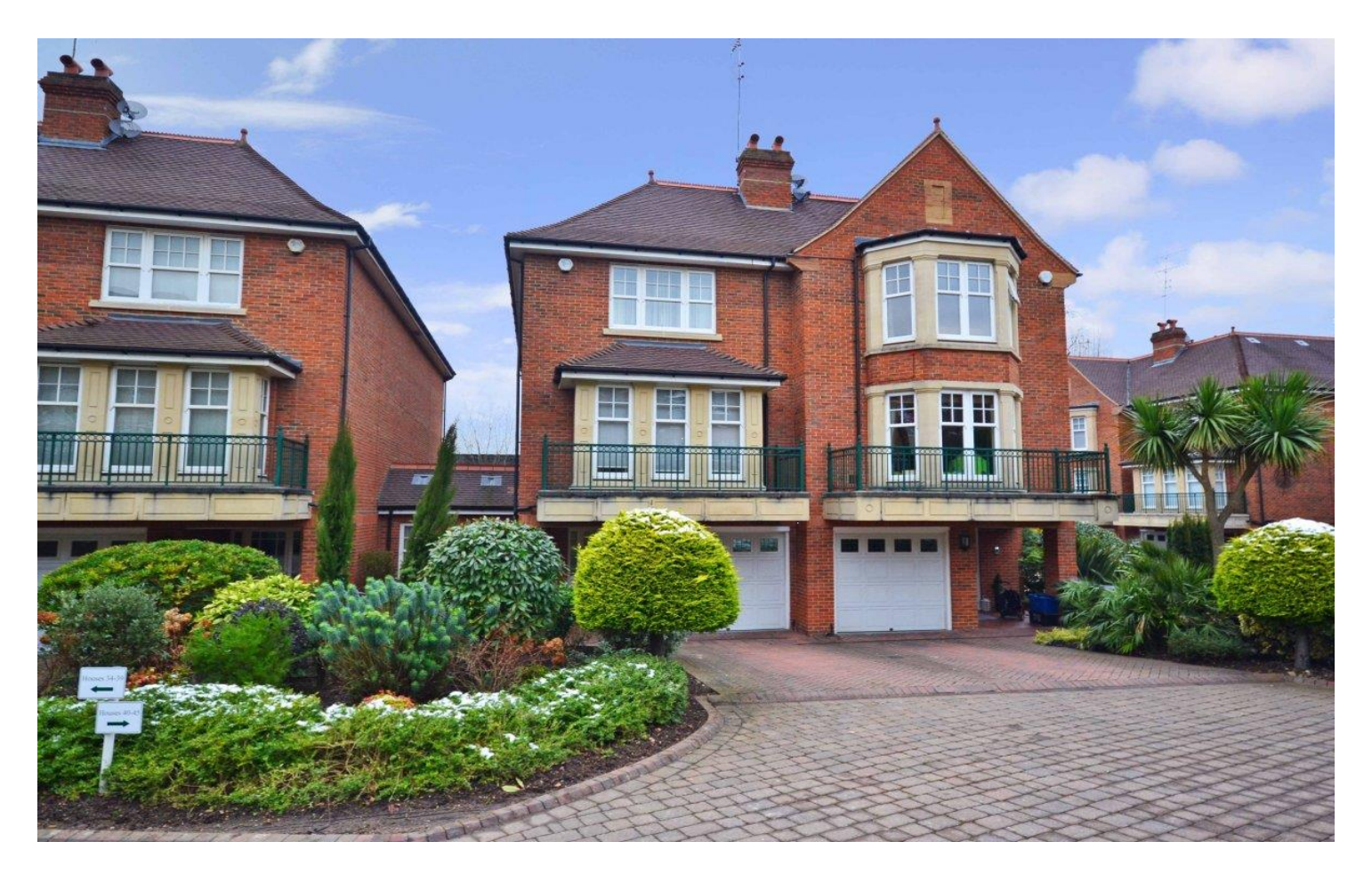
Mountview Close, Hampstead Garden Suburb, London, NW11

A modern five bedroom townhouse situated in this gated development adjacent to Golders Hill Park and 0.6 miles from Golders Green Underground Station (Northern Line). The house is set over four floors and is offered on an unfurnished basis. The property also has use of the private communal gym. This house has an open plan kitchen/dining room leading to conservatory, double reception room, five double bedrooms (two with en-suite bathrooms), family bathroom and guest cloakroom. Additional benefits include a study, utility room, paved rear garden, garage and off street parking.