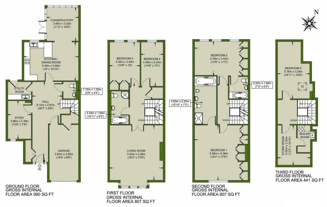
APPROX. GROSS INTERNAL FLOOR AREA 3045 SQ FT / 283 SQ M \,

All measurements of walls, doors, windows, fittings and appliances, including their size and location, are shown as standard sizes and therefore cannot be regarded as a representation by the seller.