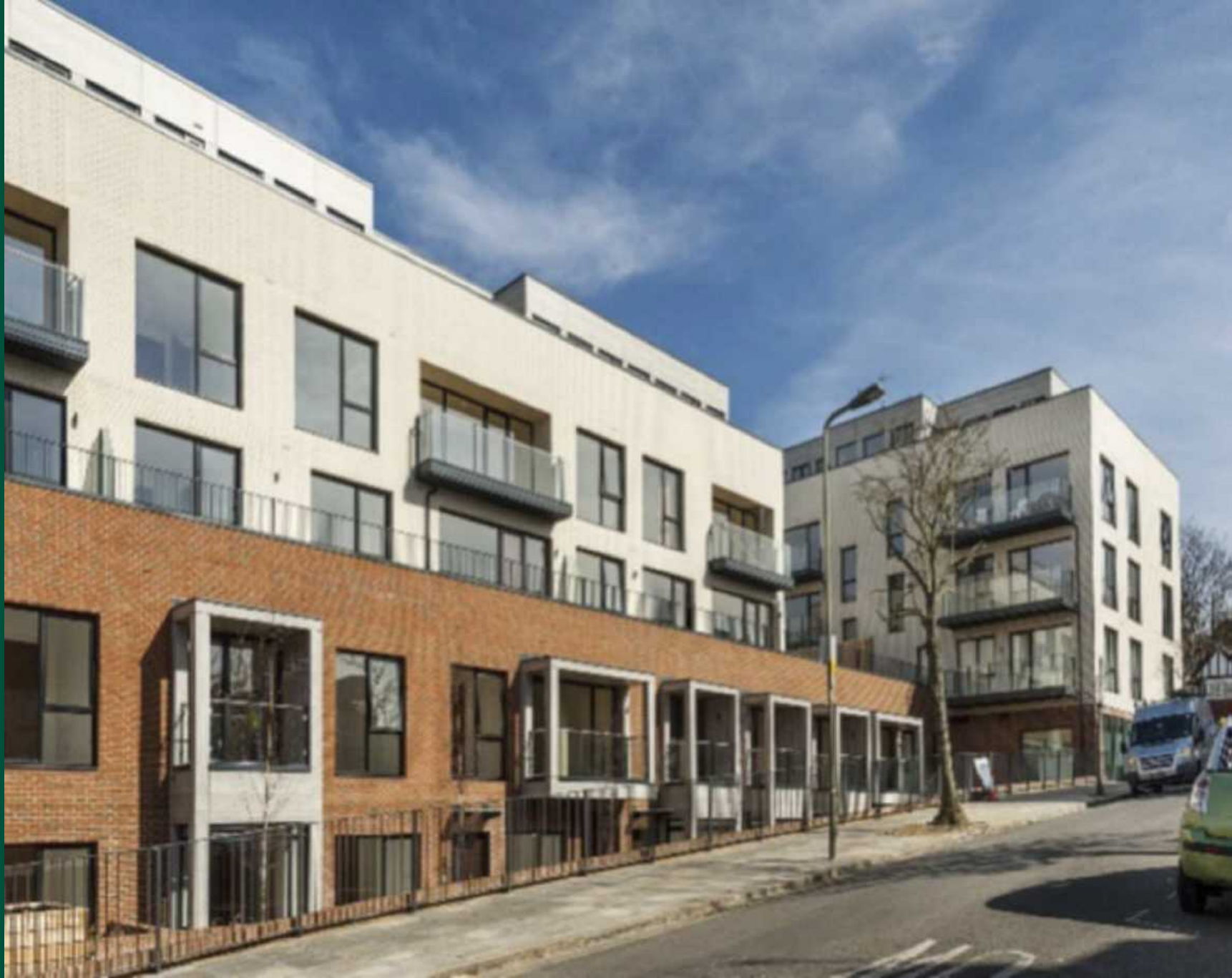
Lexington Place, Finchley Road, NW11