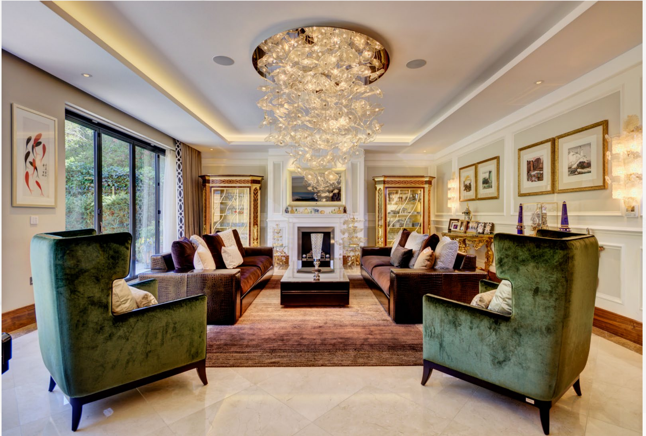
EXCEPTIONALLY SPACIOUS & BRIGHT ENTERTAINING RECEPTION AREA