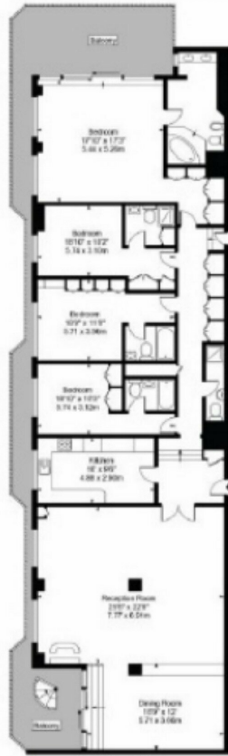
Seventh Floor For Illustration Purposes Only - Not To Scale